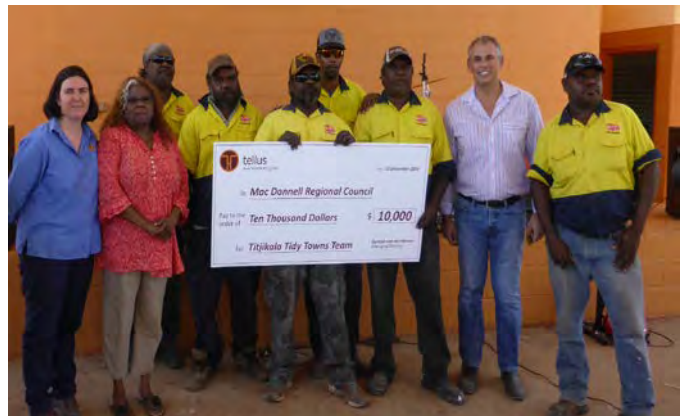
Tellus would continue to support the local community through construction and operation of the Proposal.